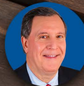
COMMISSIONER JOE CAROLLO D-3