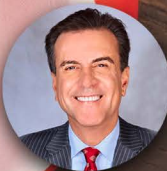
COMMISSIONER ALEX DIAZ DE LA PORTILLA -D1