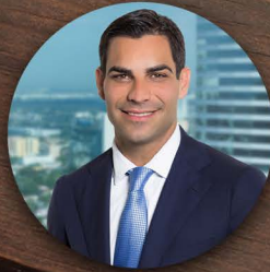
MAYOR FRANCIS SUAREZ

EDUARDO MARTURET - CONDUCTOR MUSIC & DRONE LIGHT SHOW