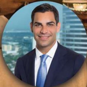
MAYOR FRANCIS SUAREZ